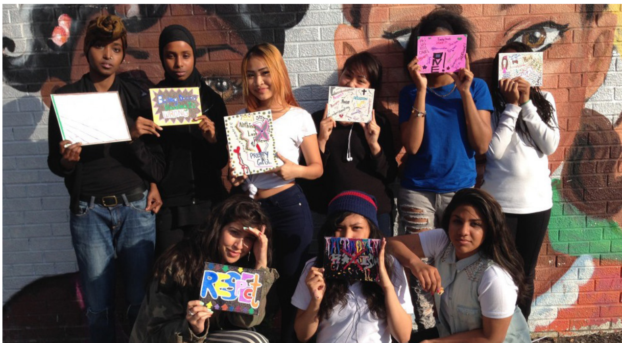
Above: The Centre for Equality Rights in Accommodation (CERA), a past Vital Toronto Fund grant recipient.

The Ward Museum is working to establish Toronto's first museum of migration to preserve and share the important stories of migrants in the city's history. It is named after The Ward, the Toronto area where early immigrant communities first settled and is now a densely populated neighbourhood in downtown Toronto. This year, the Ward Museum will run a series of community-led events inviting tourists and Torontonians to learn about the people and stories of those included in, and left out of, the 1871 census (the first census after Confederation). Learn more at www.wardmuseum.ca