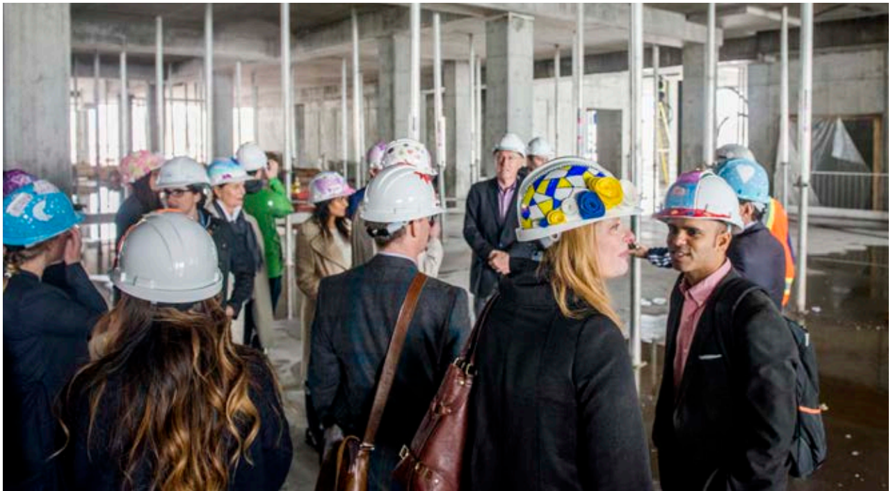
Above: Toronto Foundation staff and others on a tour of Daniels Artscape Launchpad in spring 2017. This space is the recipient of Toronto Foundation's second social impact investment.

Toronto Parks and Trees Foundation has been helping Toronto transform its parks and green spaces since 2002. They work with the City of Toronto, community groups, neighbourhoods, individuals, and businesses to reimagine local parks and improve the health of Toronto's urban forest. Through city-wide collaboration, they support tree planting and stewardship efforts and provide parks and green space enhancements that cannot be achieved through public funding alone. Learn more at www.torontoparksandtrees.ca