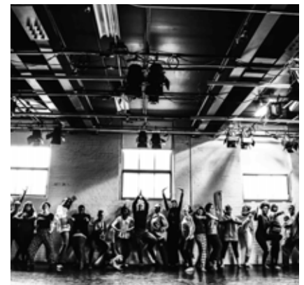
Above: Staff and program participants from previous grantees: LostLyrics, UNITY Charity, and The Watah School