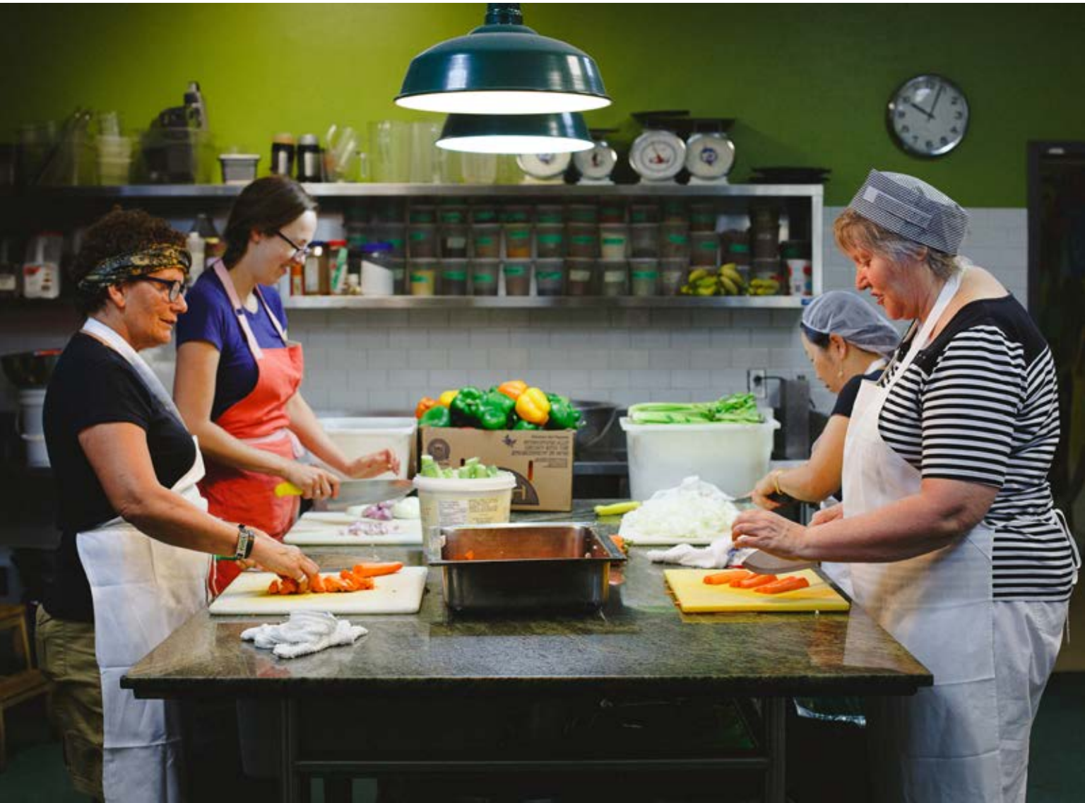
Above: Volunteers at The Stop Community Food Centre